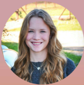
Kinlee Pack Erath Co