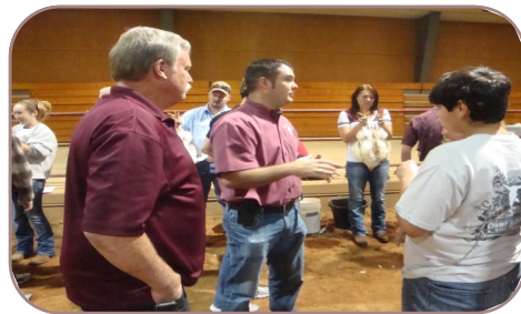
Learn from the "experts", ask them ?s