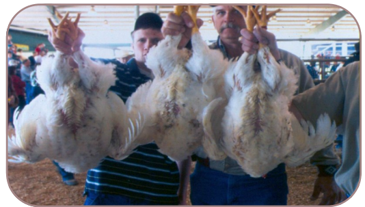
Learn about selection and showing your birds