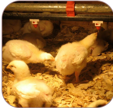
Learn about raising show poultry

101 Kleberg Building MS 2472 TAMU College Station, TX 77843 Phone: 979-845-4318