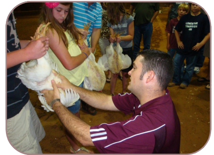
Hear from the judges themselves what they are looking for